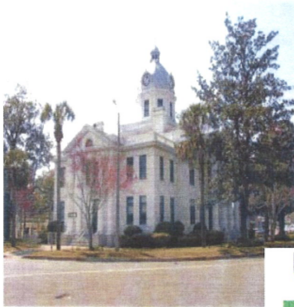
Jefferson County Courthouse