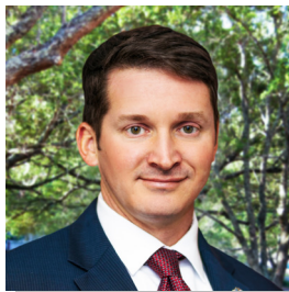
Dane Eagle Florida Department of Economic Opportunity (DEO), Ex-Officio